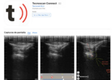
App Tecnoscan Connect (Android and iOS)